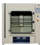
Corrosionbox 1000 I