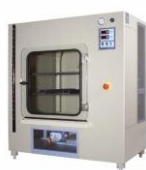
Corrosionbox 400 I